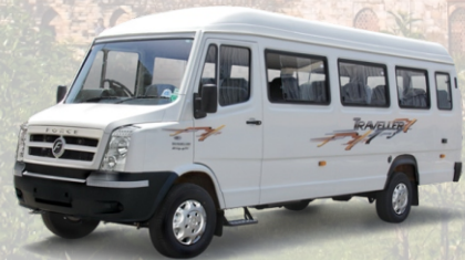
TEMPO TRAVELLER 9+1 Seats