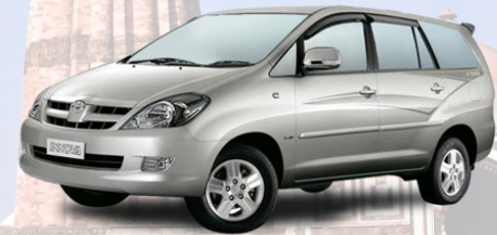
INNOVA 5+1 Seats