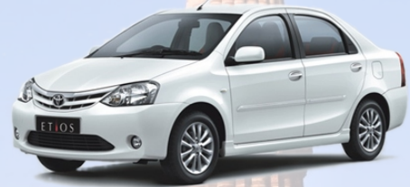
ETIOS : 4+1 Seats

Our patrons are our priority and we cater to all their needs in every possible manner. Our executives are always eager to customize the services of the travel plan according to the budget of our customers. Our well-experienced staff will make your trips smooth and problem free. All you need to do is give us a chance to prove us right. So, if you need to hire a car service in India, you can get in touch with our customer support team via phone call or email. We will assist you to choose the best car/coach as per the number of traveler. Hire a car at Indian Dream Travel and enjoy the beautiful India with it.